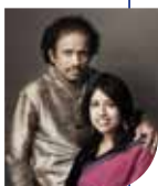
Padma Bhushan Dr. L. Subramaniam Padma Shri Mrs. Kavita Krishnamurti

"We feel very proud and happy to collaborate with Vishwakarma University, Pune. We are privileged to be the mentor and knowledge partner at VU, Pune."